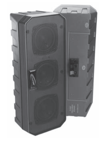
PI30-SP Non-Powered Speaker